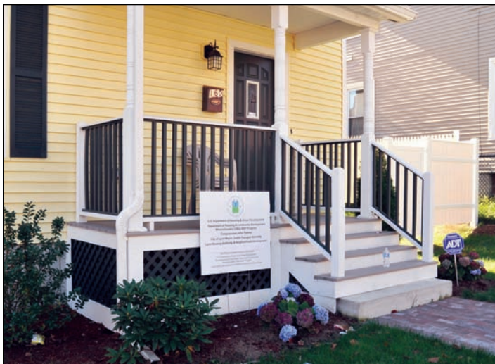
160 Essex Street, a single family home renovated through the NSP.