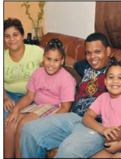
The Torres family.